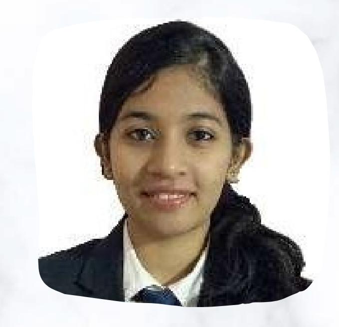
BHOOMIKASA WILEY MTHREE 11LPA